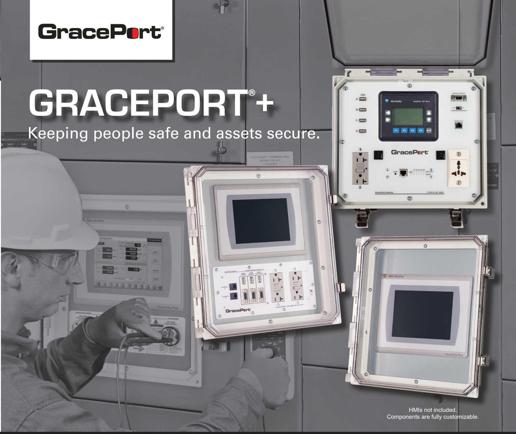
HMIs not included. Components are fully customizable.