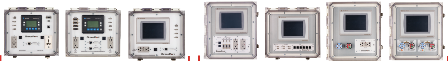
GracePort®+ Fully Assembled GracePort®+ HMI Covers with optional UL Recognized Type 1 GracePort®

For a complete list of housings, components, circuit breakers and power options, refer to our Literature section at: www.graceport.com