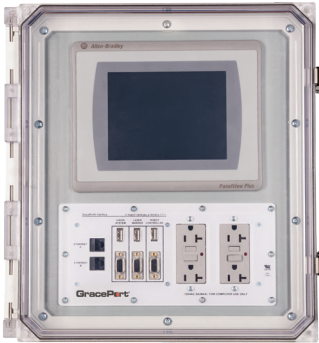
HMI not included. Components are fully customizable.

GracePort®+ is a Human Machine Interface (HMI) cover kit that compliments our existing line of GracePort® components and Permanent Electrical Safety Devices (PESDs) by conveniently placing them within a large protected housing. The cover kit features a strong and rigid design, mounting securely to the outside of an enclosure and makes accessibility to electronic components easy. The GracePort®+ is designed to provide protection for valuable components from dust, dirt, oil, water, and other environmental contaminants found in the industrial setting.